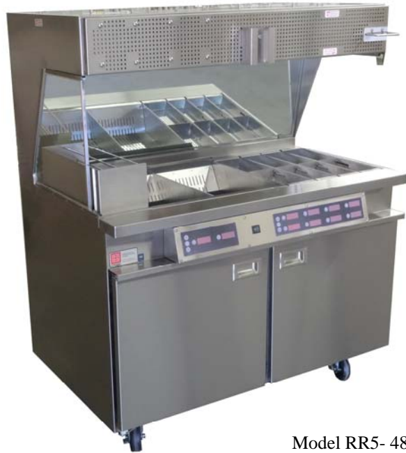
Model RR5- 48.5LT (dump left shown)

The Marshall Models RR5-48.5 and RR5-42 Fry Dump Stations feature our ThermoGlo™ heating technology. Heat radiates from every square inch of the upper flat plate heating surface. This eliminates the need to clean intricate cal-rod, wire and reflector assemblies. There is also auxiliary bottom heat. This dump station includes four organizers and a fry dump pan with a bagged fry holder.